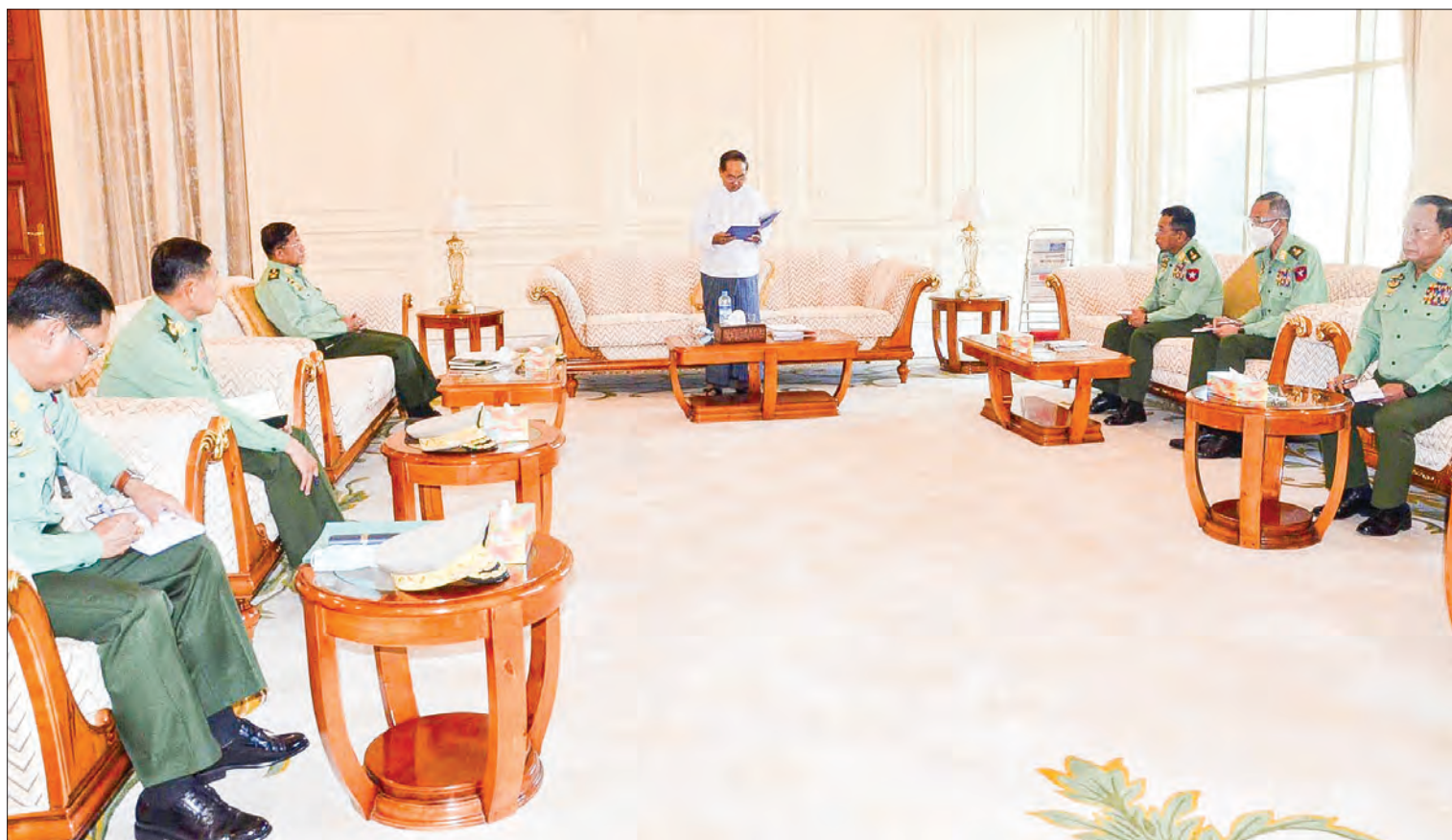
Acting President U Myint Swe declares the State of Emergency and hands over legislative, executive and judicial powers of the State to the Commander-in-Chief of Defence Services on 1 February 2021.

The Commander-in-Chief of Defence Services had repeatedly dealt with the matter of ensuring a free and fair election which is the foundation of multiparty democracy and an open political process before the election. The decision to certify a "free and fair election" cannot be made in a day. It must be rechecked whether there was freeness and fairness and cleanness during the canvassing period, election period and post-election peri-