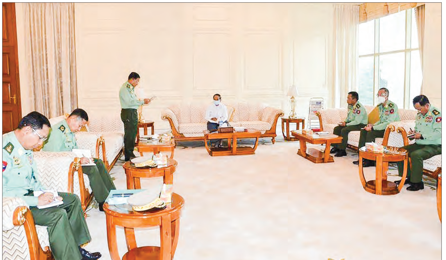
Commander-in-Chief of Defence Services Senior General Min Aung Hlaing presents the national situation at the National Defence and Security Council meeting at the President House in Nay Pyi Taw on 1 February 2021.

In presenting the national situation, the Senior General said the Tatmadaw always keeps in the fore the motto "People are the Parents" when it comes to the people. People aspire a multiparty democratic system. So, the Tatmadaw adopted the political culture of conducting democracy transition process through negotiations and legal measures and in peace and stability.