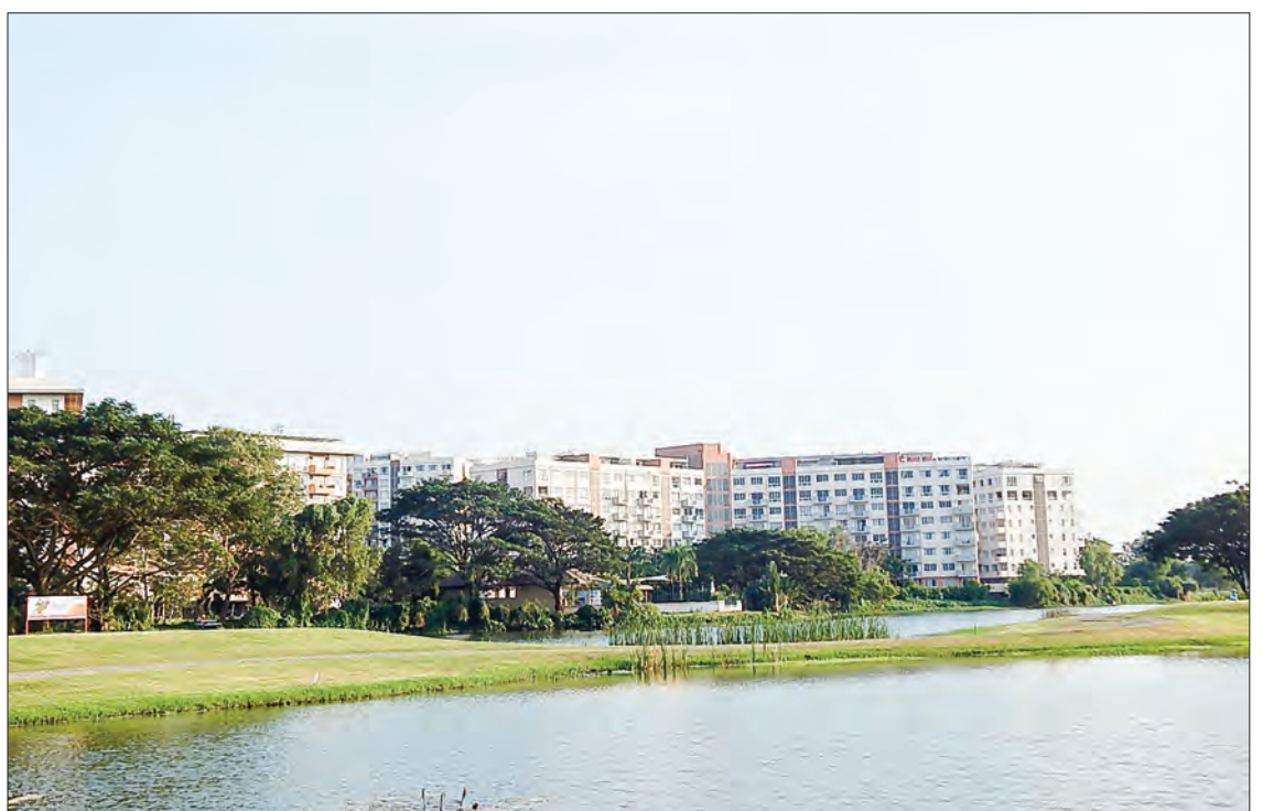
Picture shows the condominia in Thanlyin Township, Yangon Region.