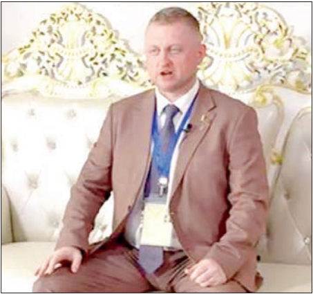
Mr Shpakouski Aliaksandr, Member of Parliament of Belarus

The leaders of the Parliamentary Committee on Cooperation with the Republic of the Union of Myanmar arrived in Myanmar on 24 December and today visited three polling stations in the city. At present, conditions are peaceful and calm, and every measure has been taken to ensure that citizens can freely express their will. Elections are the only legitimate path in the political process, and we believe they provide fair competition in establishing authority and convening the Hluttaw. Concrete steps are being taken for dialogue and cross-party consensus. Political groups that refuse to participate in society are removing themselves from the legal framework and pursuing paths inconsistent with the constitutional framework. Such groups are undermining election activities in certain areas to prevent the proper conduct of the electoral process. We believe that, based on the results of the Hluttaw elections, lawful governing bodies can be formed in the Republic of the Union of Myanmar. Belarus is always ready to assist and support in this process. Over the past four years, the Myanmar government has achieved successes in addressing domestic political issues. Although challenges remain, Belarus remains prepared to provide necessary political support to our friends in Myanmar, and the presence of Belarusian observers is part of this commitment. This serves as a testament that our leaders support Myanmar's goal of peace and the stable and secure development of its territory.