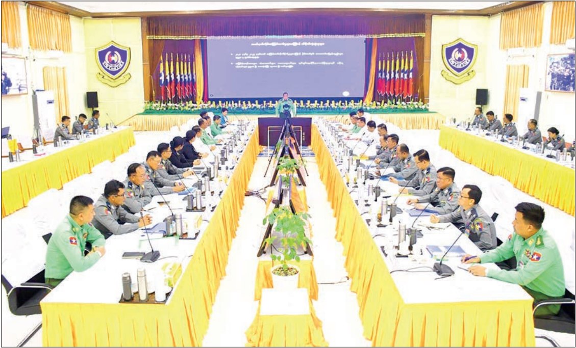
The 2025 meeting of the Central Committee on Counter-Terrorism underway yesterday, presided over by Committee Chair Union Minister Lt-Gen Tun Tun Naung.

The Union minister then mentioned the brutal actions of terrorists against the civilians, resulting in thousands of deaths, damage to 7,598 buildings and property, 9,908 deaths including civilians, monks, children, ad-