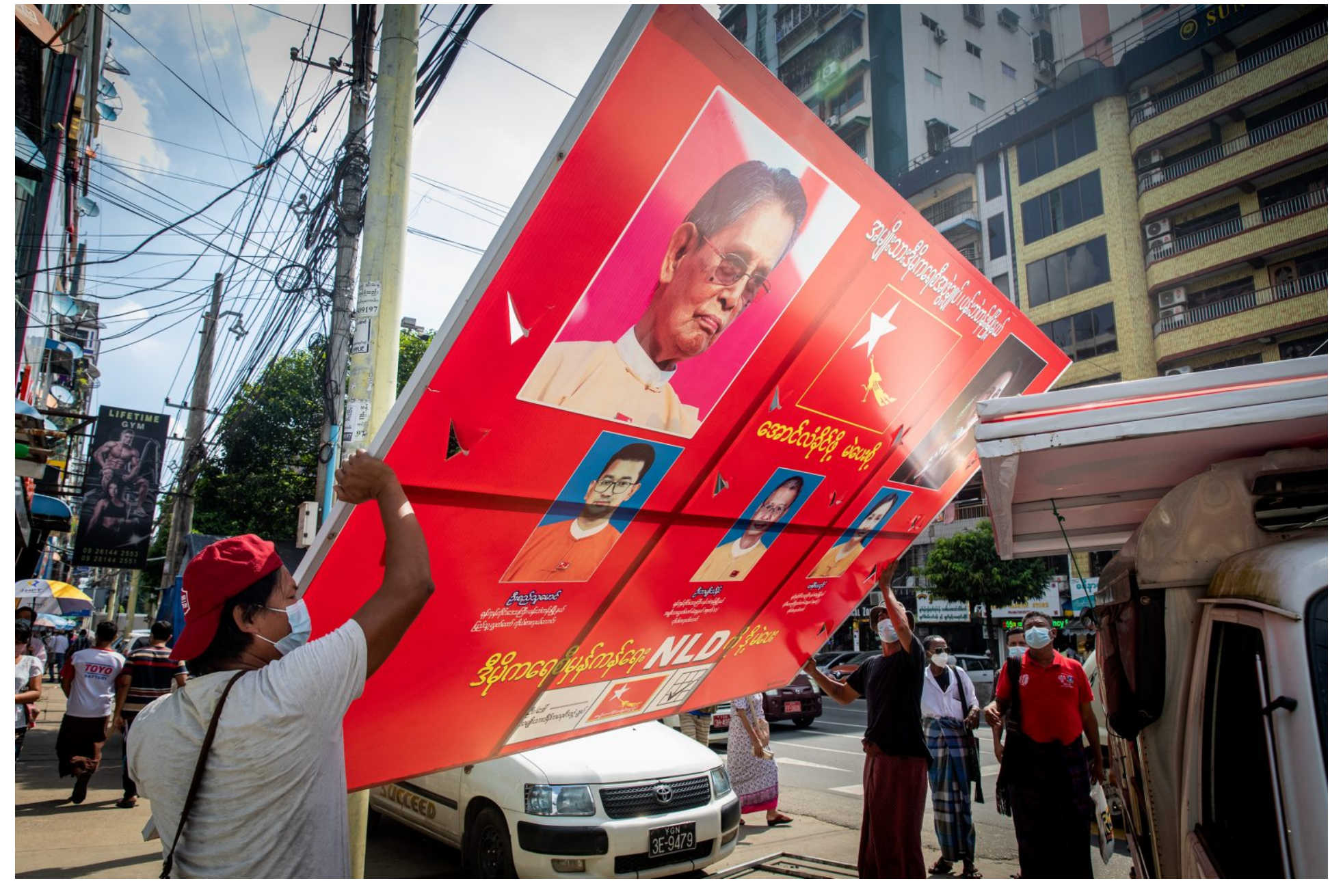
Workers in Yangon remove an NLD campaign poster ahead of the 2020 election, which the NLD won in a landslide.