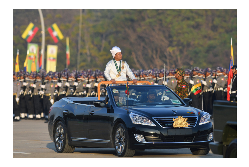
Myanmar junta marks Independence Day with show of force, mass pardons