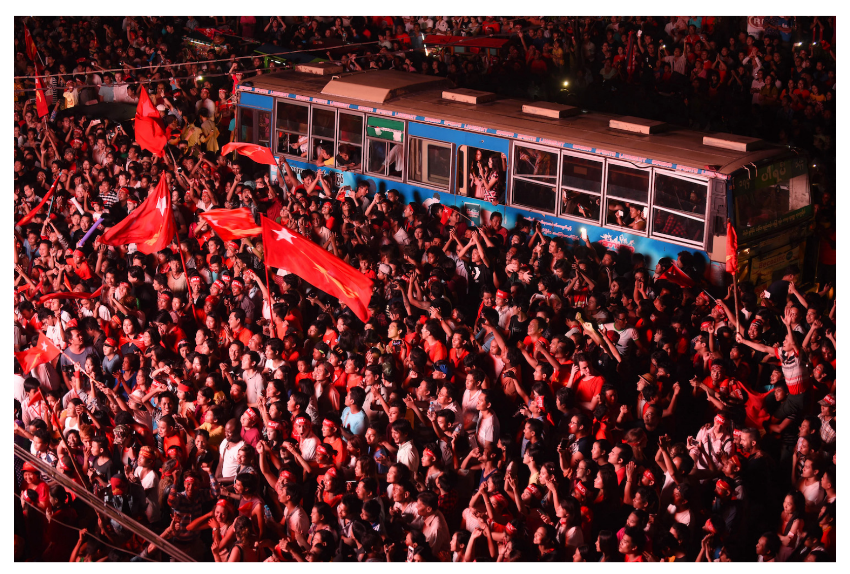
NLD supporters celebrate outside party headquarters in Yangon, after a landslide election victory in 2015, the only electoral loss the military has accepted since the 1962 coup.

The expected introduction of an entirely new voting system is clearly intended to benefit promilitary candidates, as the NLD had won more seats than its proportion of the popular vote in the winner-take-all system in 2015 and 2020, while the USDP suffered the reverse fate.