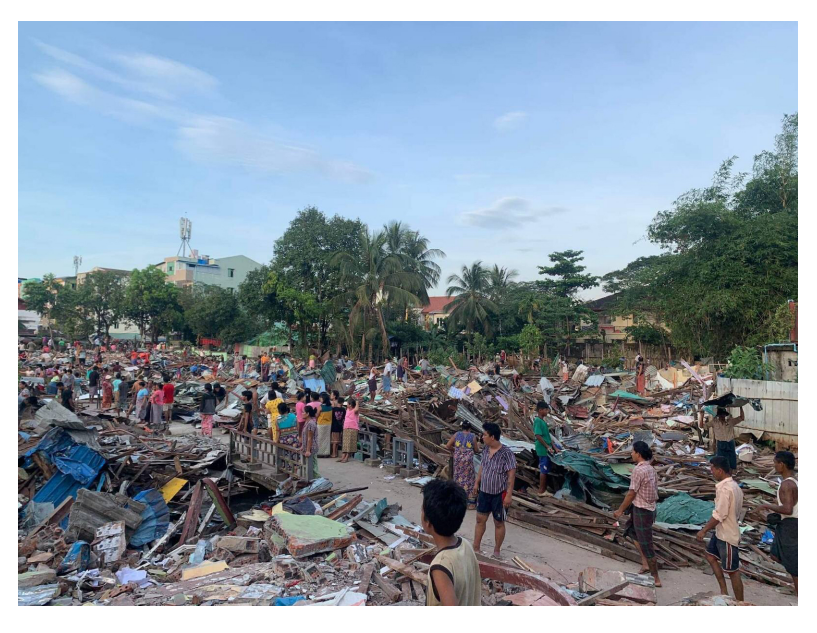
'Our way of life is dead': Military evictions ravage communities